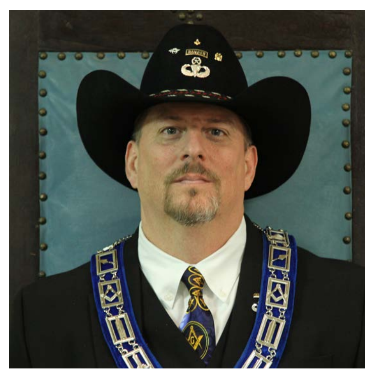
From The East: Brethren.

As I sit and write my final trestle board article, I cannot help but to reflect on my feelings when I was first elected to serve you as Worshipful Master. I was intimidated by the thoughts of living up to the great Past Masters that have led this Lodge. It is overwhelming to look at the photos of the Past Masters and then remember what great leaders they were and still are in Midland Lodge.