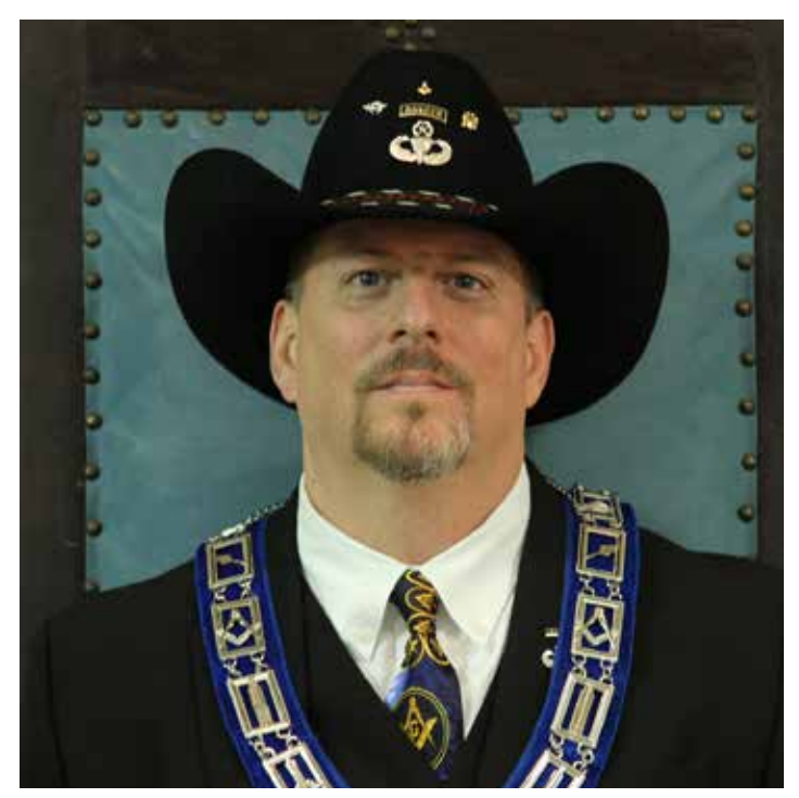
From The East:

Masonry is all about relationships, and the Square and Compass denote this as much as they denote any other explanation given in the degrees. The compass has from time immemorial represented God and heaven, as the square has represented man and earth. In the days when the fundamental building blocks of matter were represented by the four elements of earth, air, fire, and water, early Christians had a set of symbols representing these.